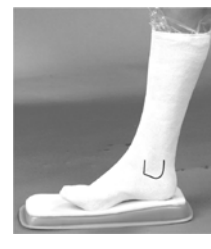
Mark medial & lateral malleolus