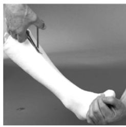
Cut along cutting strip-full length