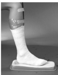
OR: semi weight bearing on foam