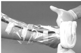
Gather STS Sock-slide onto foot/ leg