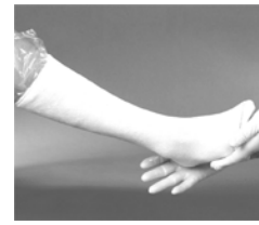
Position STJ neutral: Ankle at 90°