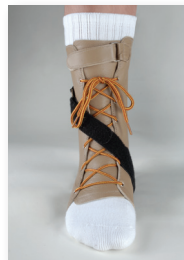
Medial Arch Suspender (9")

Specially designed Heel Post adds stability