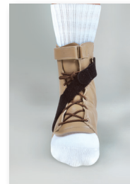
Lateral Arch Suspender (7")