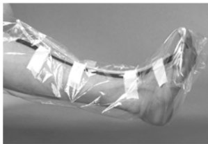
Cutting strip, tubing & bag in place