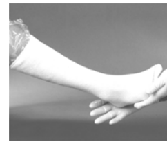
Position STJ neutral: Ankle at 90°