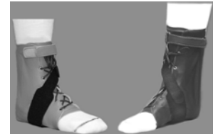
7" (left) 9" (right)